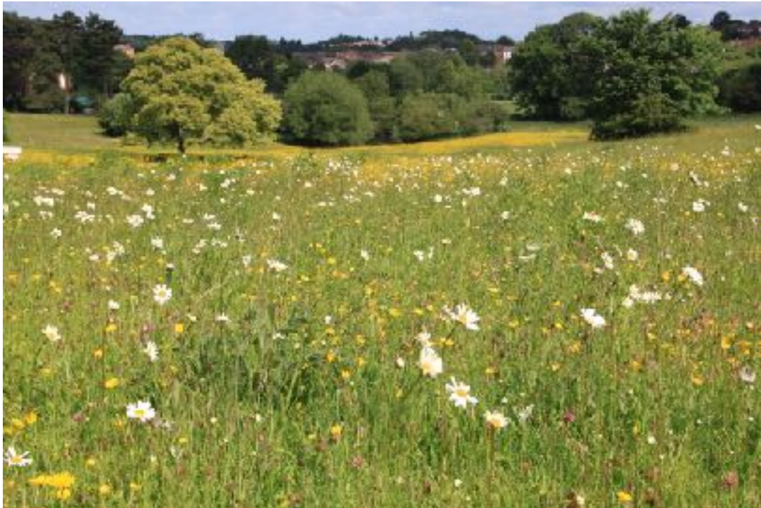
The Corbett Meadow Grassland

Conservationists were perhaps slow off the mark to recognise the value of the habitat and its plight, and even now only about half receives legal protection. Much is privately owned, and conservation efforts currently centre around restoration and recreation projects and the provision of advice and information to landowners.