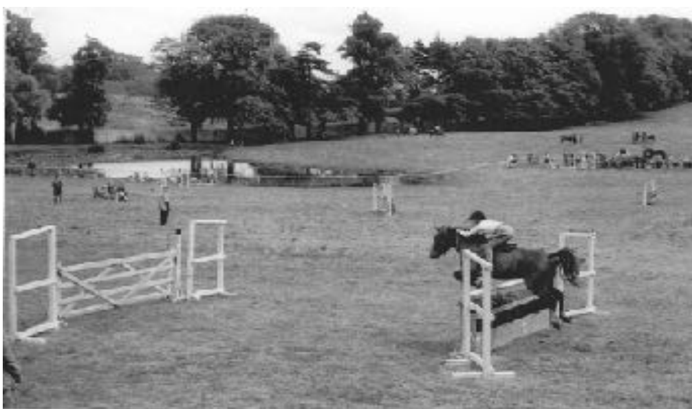
The Gymkhana in the Corbett Hospital Meadow, at one of the annual Fetes during the 1950s

The land can be considered to be of historical significance currently due to the presence of the veteran/ancient trees on site, which represent an important historic landscape feature.