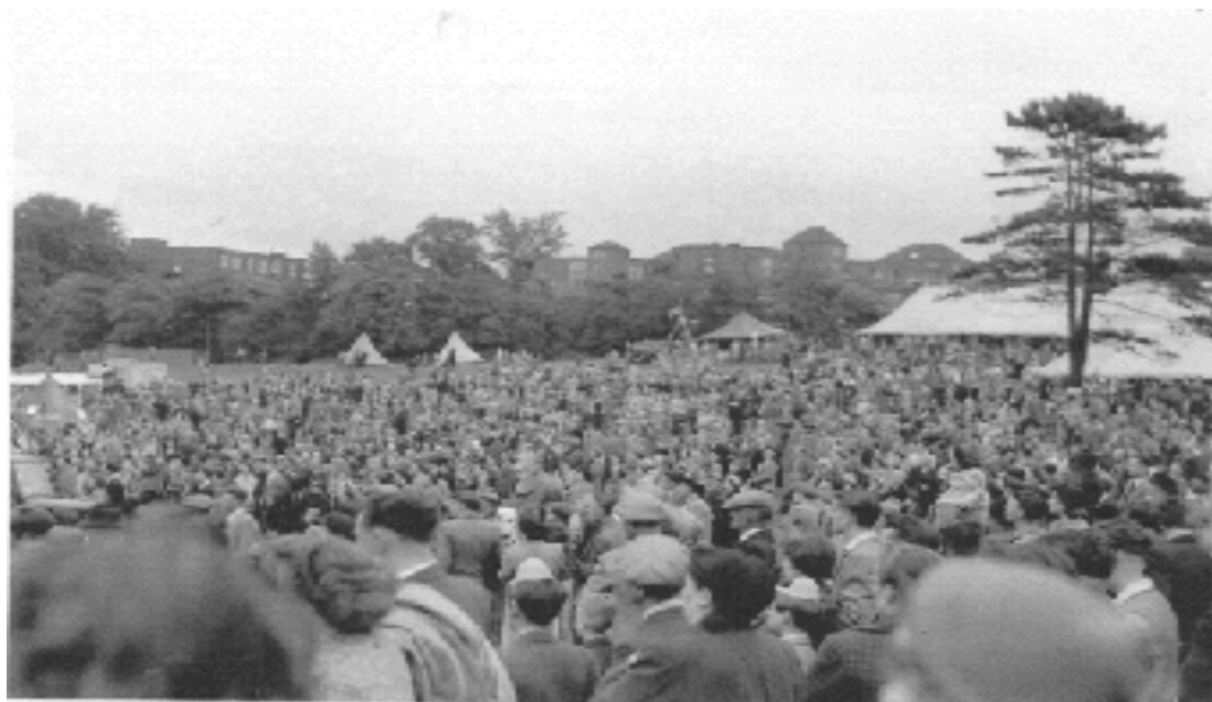
Corbett Hospital Fete Circa 1940s

Each evening, concluding with a grand Naval Salute, and other specially arranged Motions.