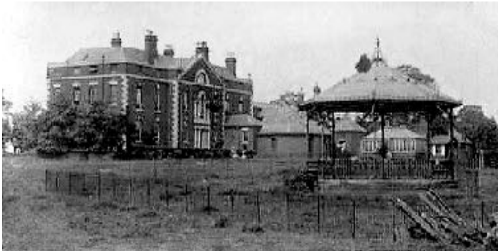
Rear of the Corbett Hospital showing the Bandstand paid for by John Corbett

Following the demolition of the original building after it closed in 2005 after 112 years in use, the new building remains situated within the grounds of the original one, which was demolished in late 2007, John Corbett’s legacy is still fondly remembered and illustrated through artwork on the side of the Stourbridge Health and Social Centre and the Three Villages Medical Centre.