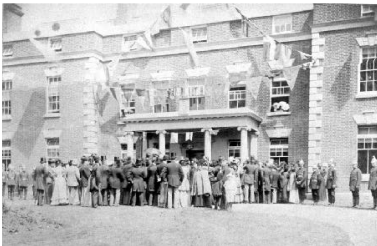
Corbett Hospital opening on 31st July 1893