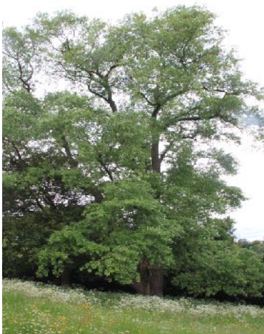
showing a Vintage / Ancient Poplar species.

Furthermore, The State of Nature Report (2016) concluded that the health benefits of living with a view of green space are worth up to £300 per person per year because simply looking at nature lifts people's spirits, according to scientific research. Unfortunately, these benefits are rarely considered when decisions are made about granting permission for building and other development.