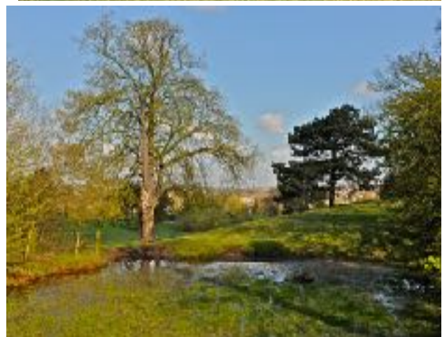
(Right) Picture Lower Pond North of the Meadow (Left) Picture Pond S.E. of the Corbett Meadow

Both Natural Ponds support marginal water flora and and water plants (see Botanical Survey) all of these sustain many pondlife insects including Damselfly and Dragonfly. The ponds and flora are important for these insects to lay their eggs. The ponds also attract other animals and birds as part of the food chain such as the Swallow, House Martin and especially the declining Swift that returns to the Amblecote area to breed and fly over the Meadow area and Ponds to feed. The muddy edges of both