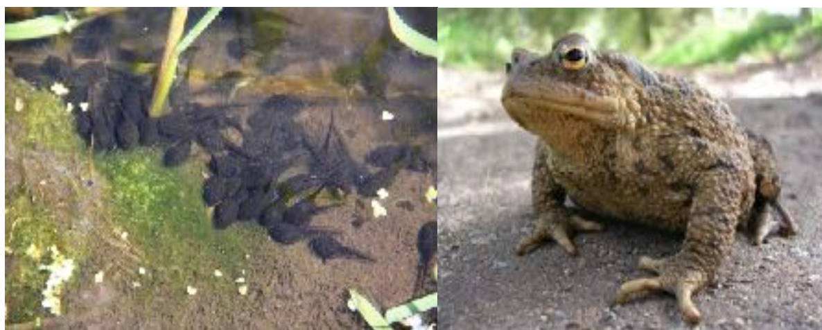
Toad and Frog Spawn taken May 2019 Pond SE of The Corbett Meadow

The meadow includes natural two ponds, a habitat that is very much in decline, these sustain a healthy amphibian population, providing a breeding area for an enormous common toad population, especially the pond South East of the meadow, which is significant as they are in rapid decline and are a priority species on the national and local biodiversity action plans.