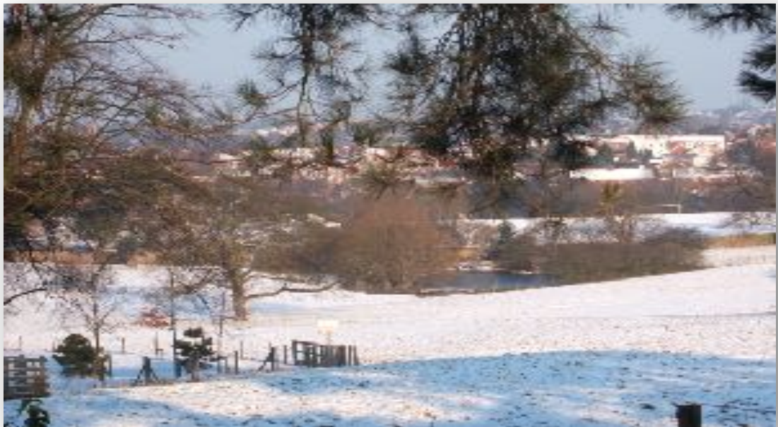
Winter in the Meadow

It is well known that in harsh winter months, in years past, skating took place on the pond.