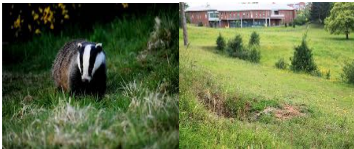
BADGER SETT ON THE EAST OF THE MEADOW

Badgers are protected and so are the setts (burrows) they live in. Under the Protection of Badgers Act 1992 , in England and Wales (the law is different in Scotland) it is an offence to: wilfully kill, injure or take a badger (or attempt to do so).