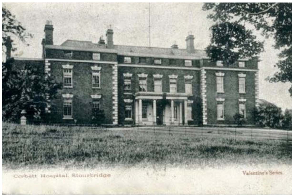
Corbett Hospital 1903