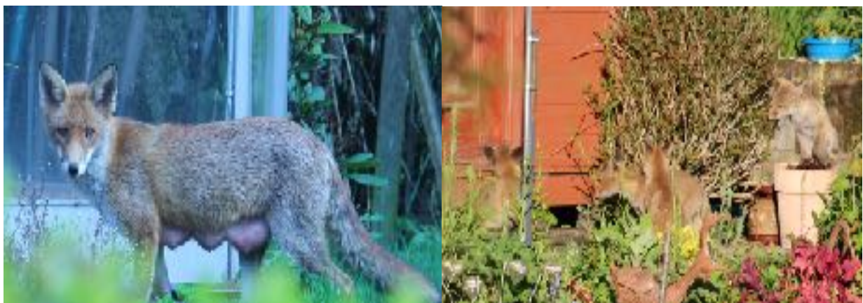
PHOTOGRAPH'S BY A LOCAL RESIDENT VIXEN & CUBS - TAKEN IN THEIR GARDEN

The larger mammals, the Fox and Badger are resident on the Meadow. Fox earths are to be found on the Meadow. The pictures below show the Vixen, recently photographed by a resident by the Meadow and shortly after with her cubs. We know the urban Fox is now very common, but this sight has given great delight and enormous pleasure to those residents who live by the Meadow, providing 'real life' educational value to youngsters about the natural world, which today is sadly lacking on a local level.