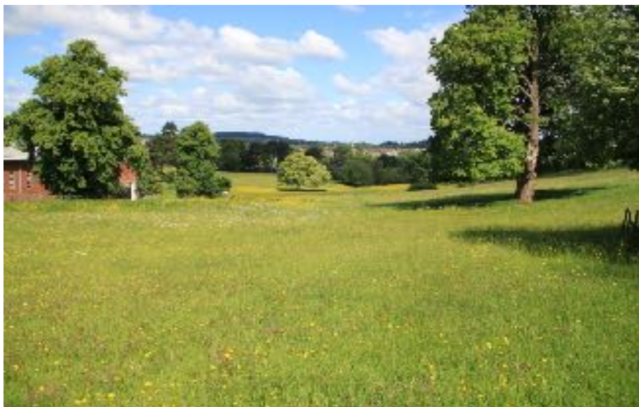
Corbett Grassland