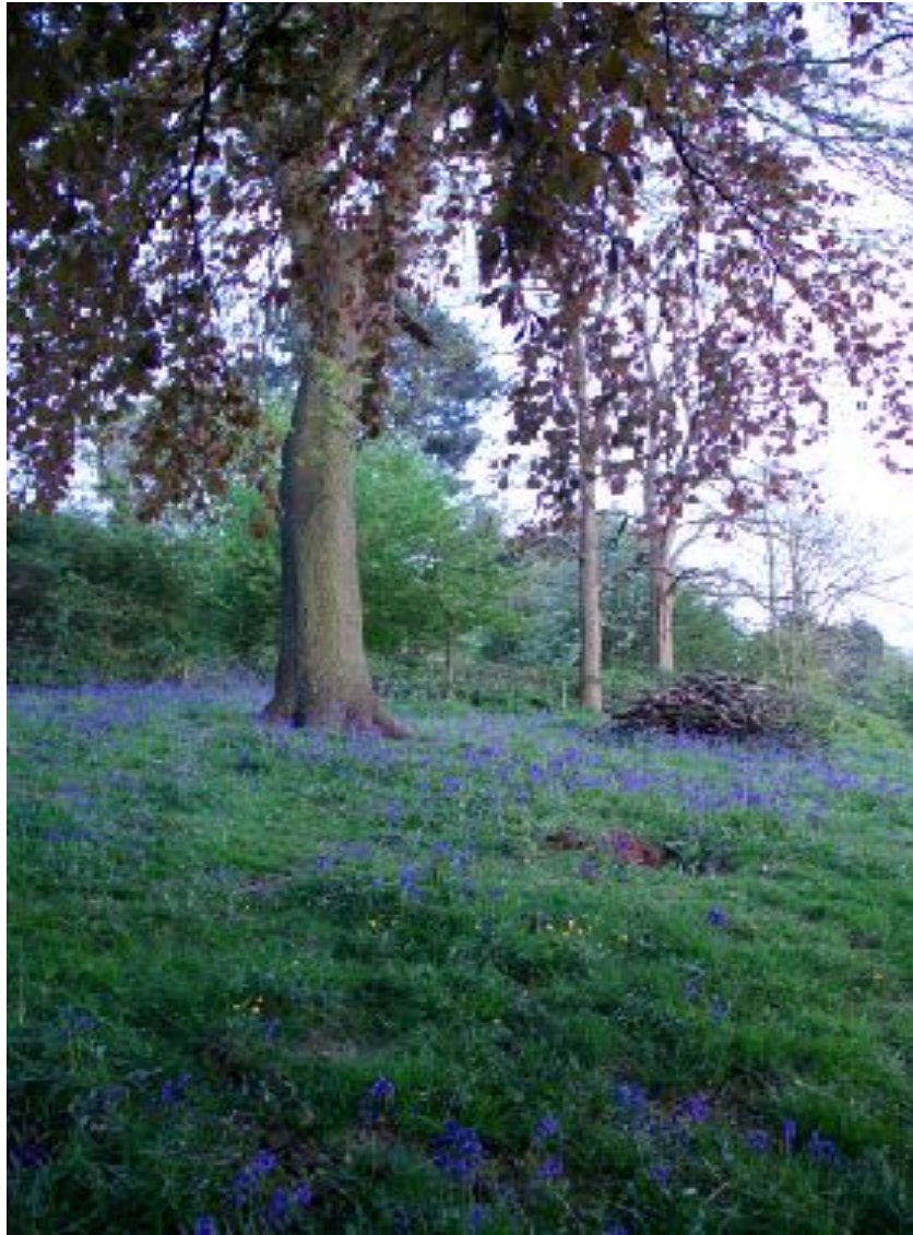
taken by History member The Meadow