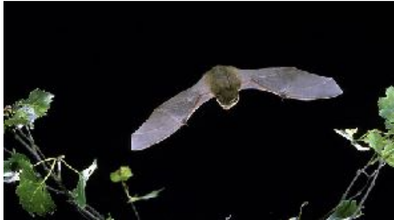
Pipistrelle Bat

Bat Conservation Trust: Sadly, many bat species around the world are vulnerable or endangered due to factors ranging from loss and fragmentation of habitat, diminished food supply, destruction of roosts, disease and hunting or killing of bats.