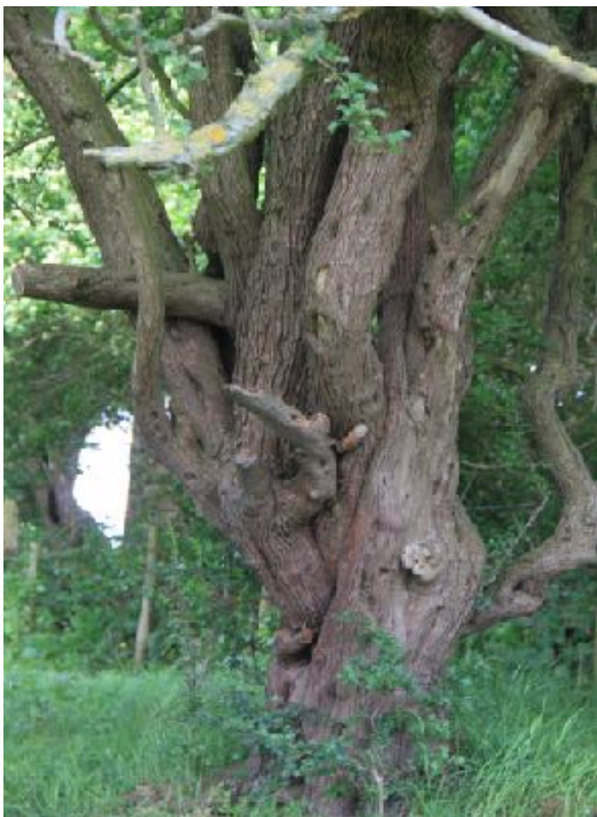
showing a Vintage / Ancient Common Hawthorne Tree one of nineteen trees.