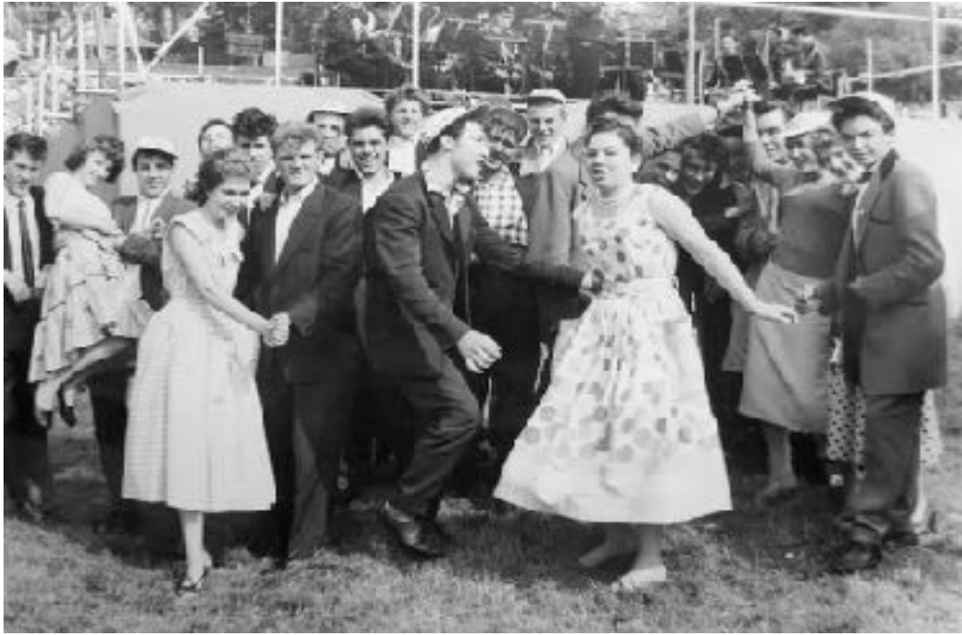
Corbett Hospital Fete 1957